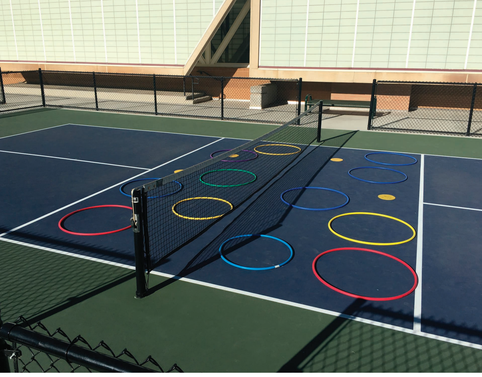
Figure 1. "You Dinked My Battleship" gameplay setup. The yellow poly spots represent the Doolittle Raiders variation.

teams try to get the ball to land in the hula hoops. Rallies are encouraged over start-and-stop play. Thus, a team may get to sink multiple hula hoops before the point is over. A rally is over when the ball lands out of bounds, cannot be returned, or does not go over the net. After each rally, each team removes the hula hoop(s) that were sunk. Game play continues until one team has all of their battleships sunk. Teams can reset and play as many times as allowed.